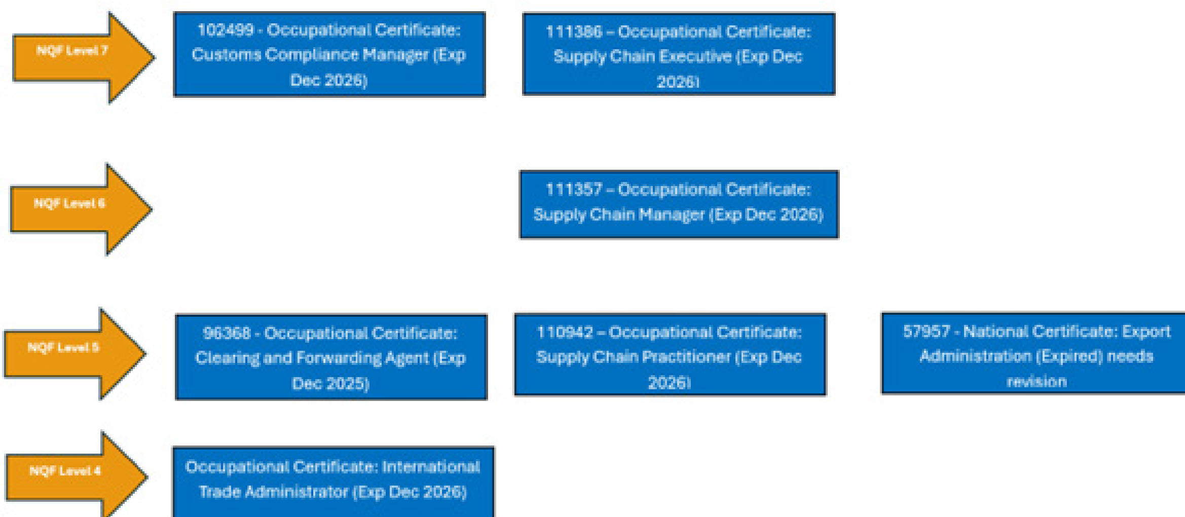
Figure 1 (Ingrid Du Buisson, 2025)